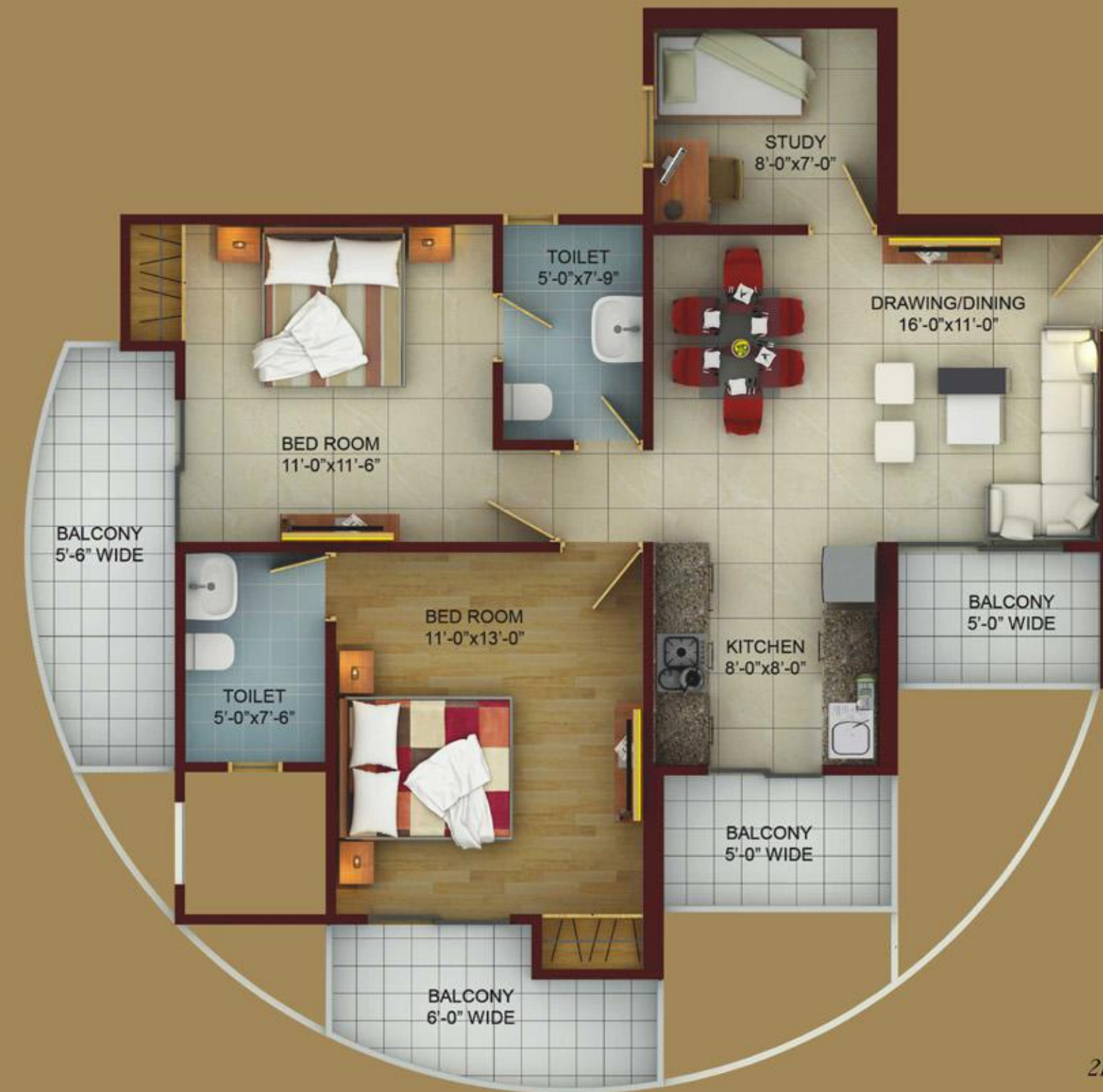
2BED+2TOILET+STUDY(Curved Balcony) BUILT UP AREA= 988SQ.FT SUPER BUILT UP AREA = 1245 SQFT.