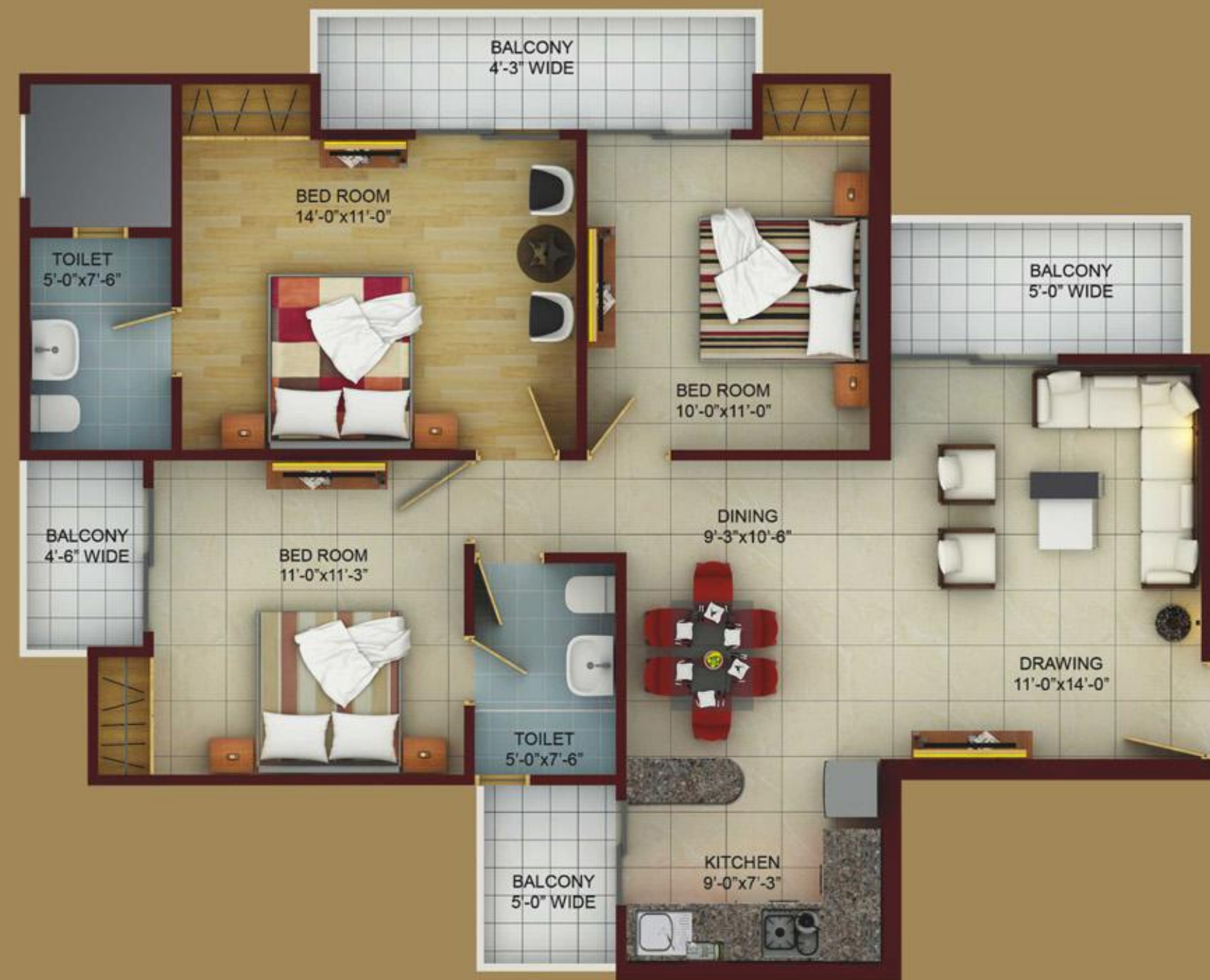
3BED+2TOILET BUILT UP AREA= 1105 SQ.FT SUPER BUILT UP AREA = 1395 SQFT.