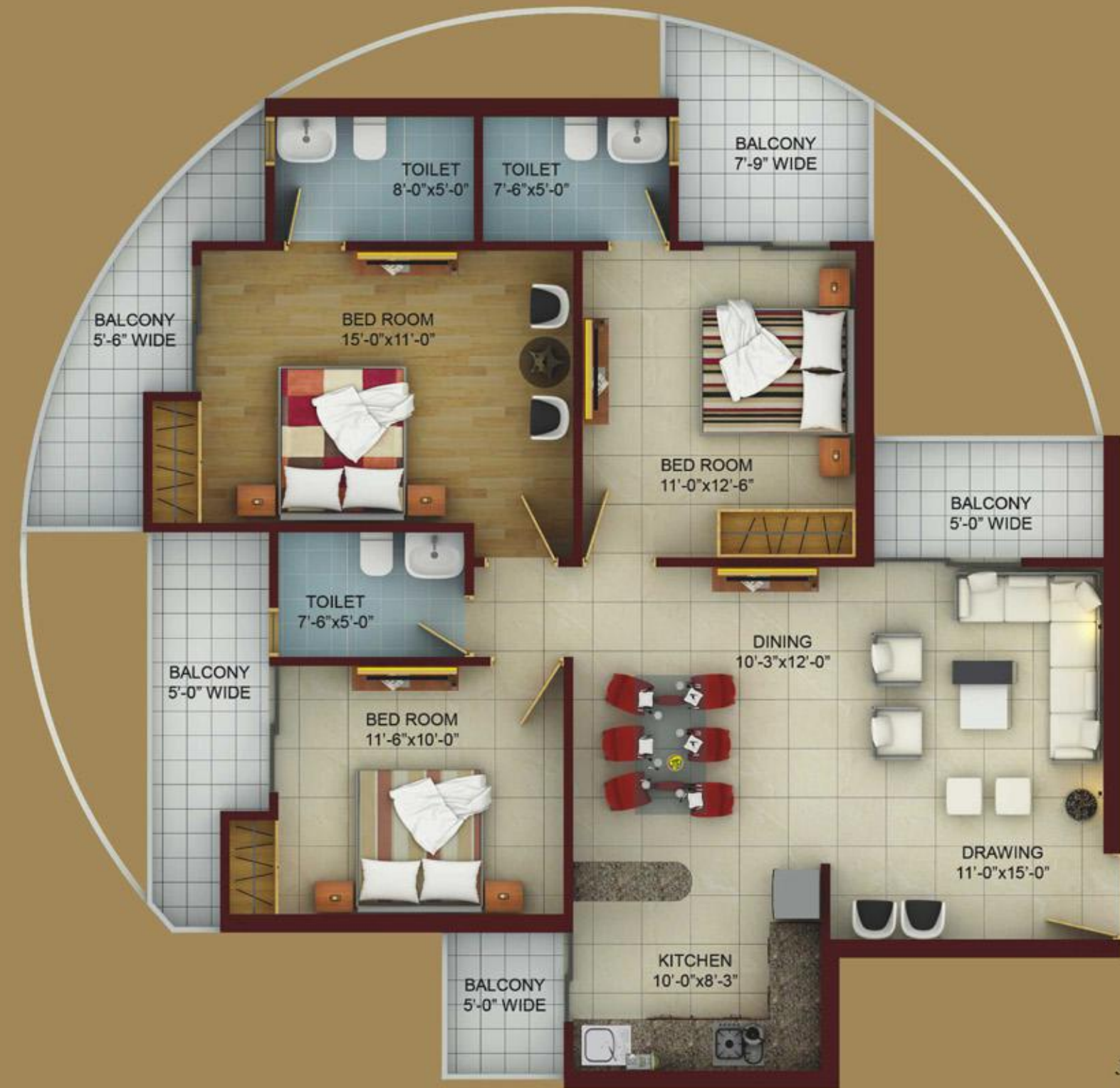
3BED+3TOILET(Curved Balcony) BUILT UP AREA= 1340 SQ.FT SUPER BUILT UP AREA = 1690 SQFT.