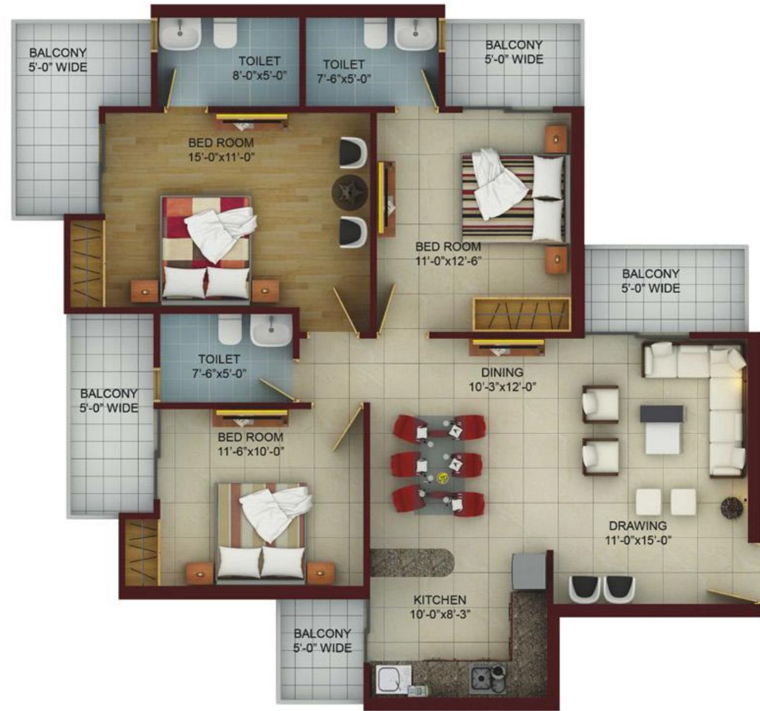
3BED+3TOILET BUILT UP AREA= 1290 SQ.FT SUPER BUILT UP AREA = 1625 SQFT.