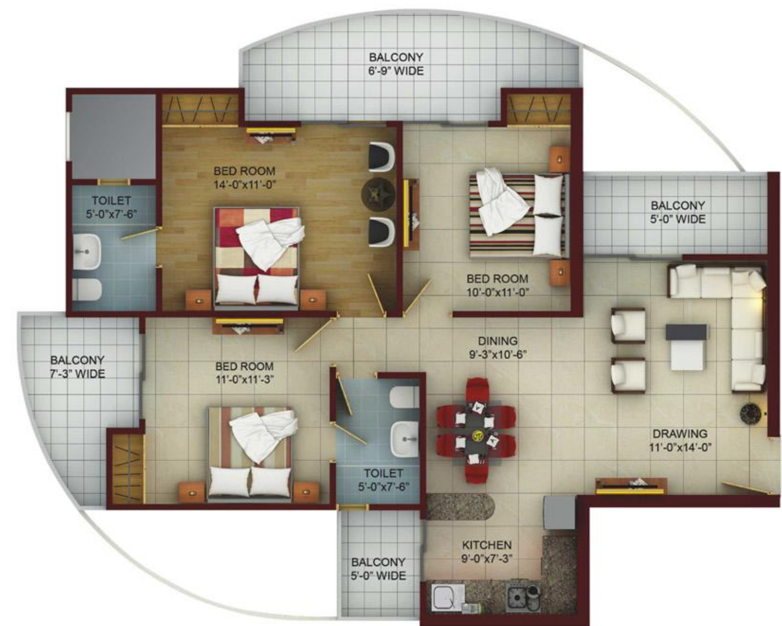
3BED+2TOILET(Curved Balcony) BUILT UP AREA= 1190 SQ.FT SUPER BUILT UP AREA = 1495 SQFT