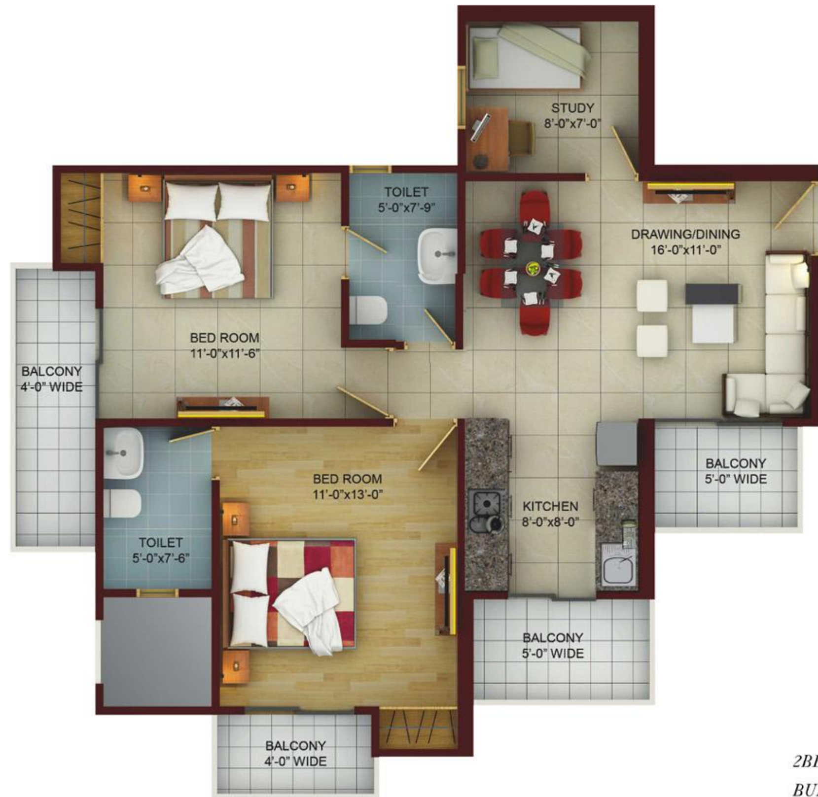
2BED+2TOILET+STUDY BUILT UP AREA= 925 SQ.FT SUPER BUILT UP AREA = 1165 SQFT.