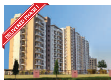
SECTOR 37C, GURGAON DWARKA EXPRESSWAY