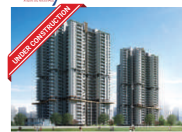
JAYPEE SPORTS CITY, YAMUNA EXPRESSWAY, GREATER NOIDA