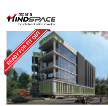
SECTOR 62, GOLF COURSE EXTENSION ROAD, GURGAON