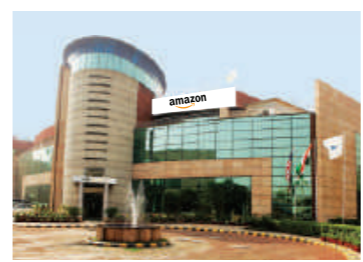
A-28, MATHURA ROAD