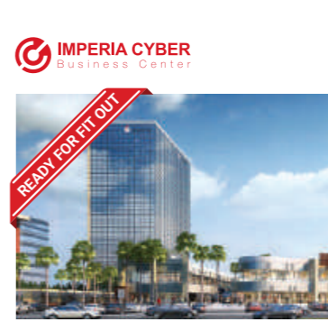
KNOWLEDGE PARK V, GREATER NOIDA WEST