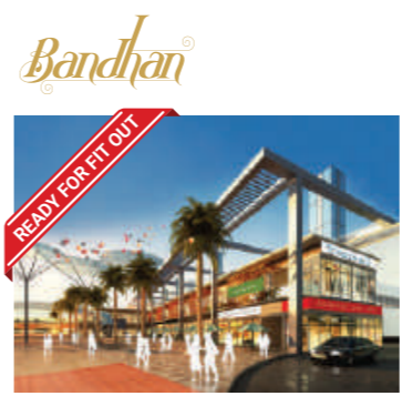
KNOWLEDGE PARK V, GREATER NOIDA WEST