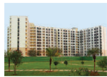
H20-RESIDENCY, GR. NOIDA WEST