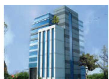
PLOT No. 7, SECTOR 125 NOIDA