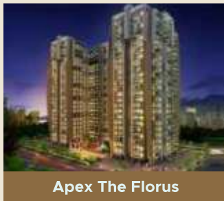
Apex The Florus