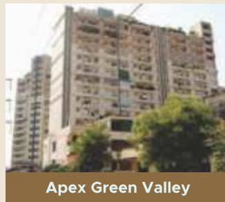
Apex Green Valley