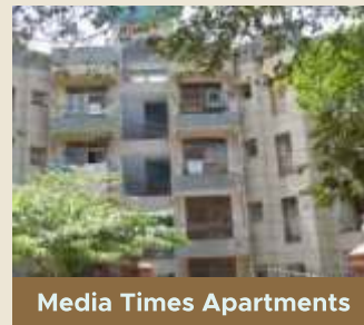
Media Times Apartments