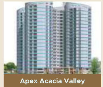
Apex Acacia Valley