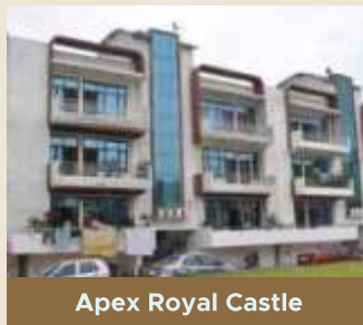
Apex Royal Castle