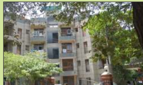
Media Times Apartments (Delivered)