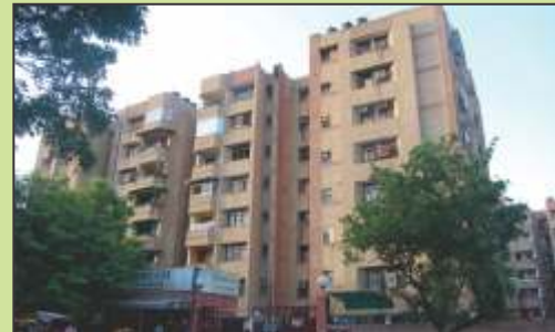
DSIDC Co-operative GHS Ltd. (Delivered Project)