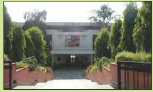
Air Force Golden Jubilee Institute (Delivered Project)