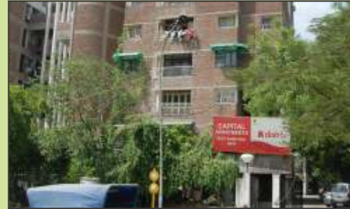
Capital Co-operative GHS Ltd. (Delivered Project)