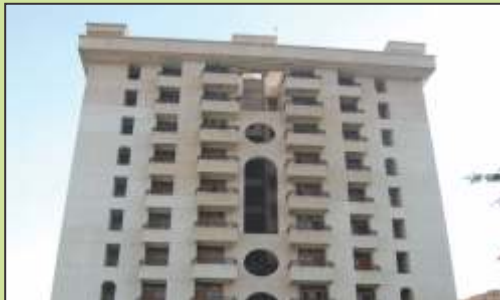
Khattar Co-operative GHS Ltd. (Delivered Project)