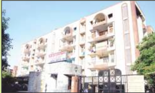
Nanda Devi Co-operative GHS Ltd. (Delivered Project)