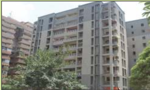
Anuradha Sehkar Awas Samiti Ltd. (Delivered Project)