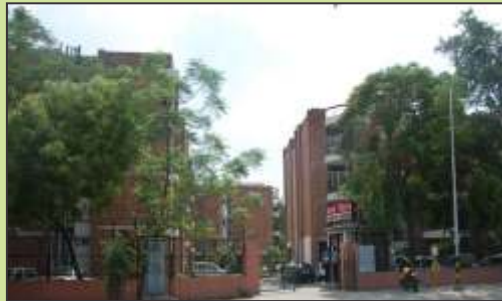
Kala Vihar Co-operative Gr. H. Society (Delivered)