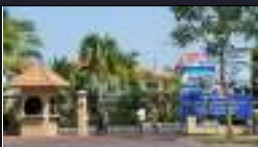
Four Side Open Gated Society