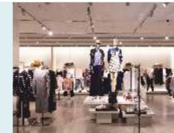
Double Height ceiling shops