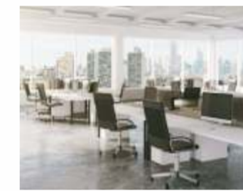
IT/ITES Office Space