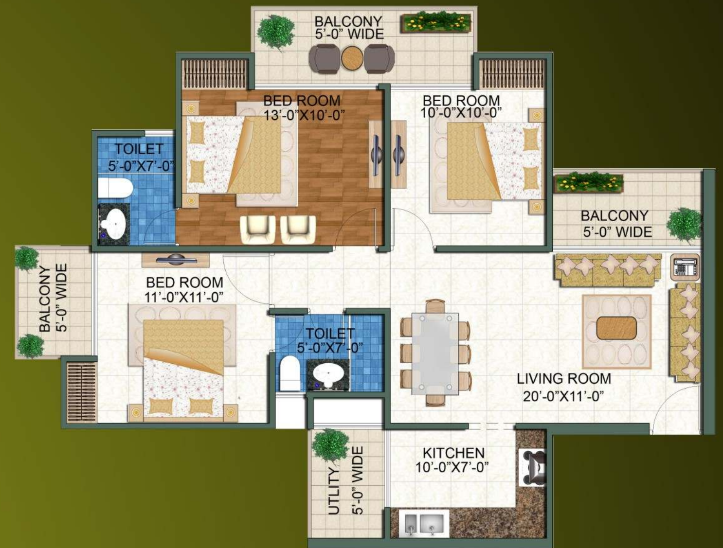
3 BEDROOM (PLATINUM-1) SUPER AREA = 1355 SQ. FT.