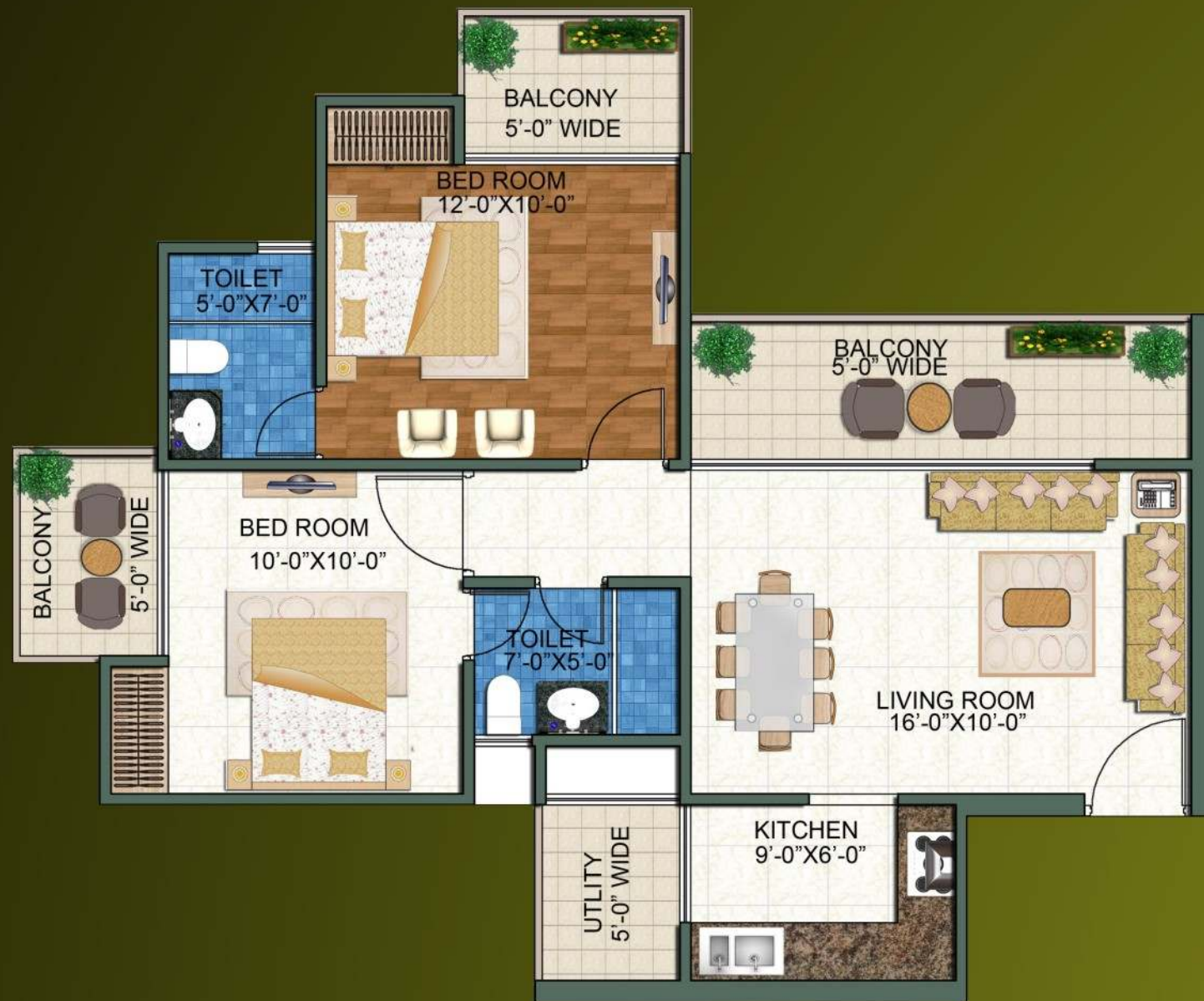
2 BEDROOM (GOLD-1) SUPER AREA = 1050 SQ. FT.