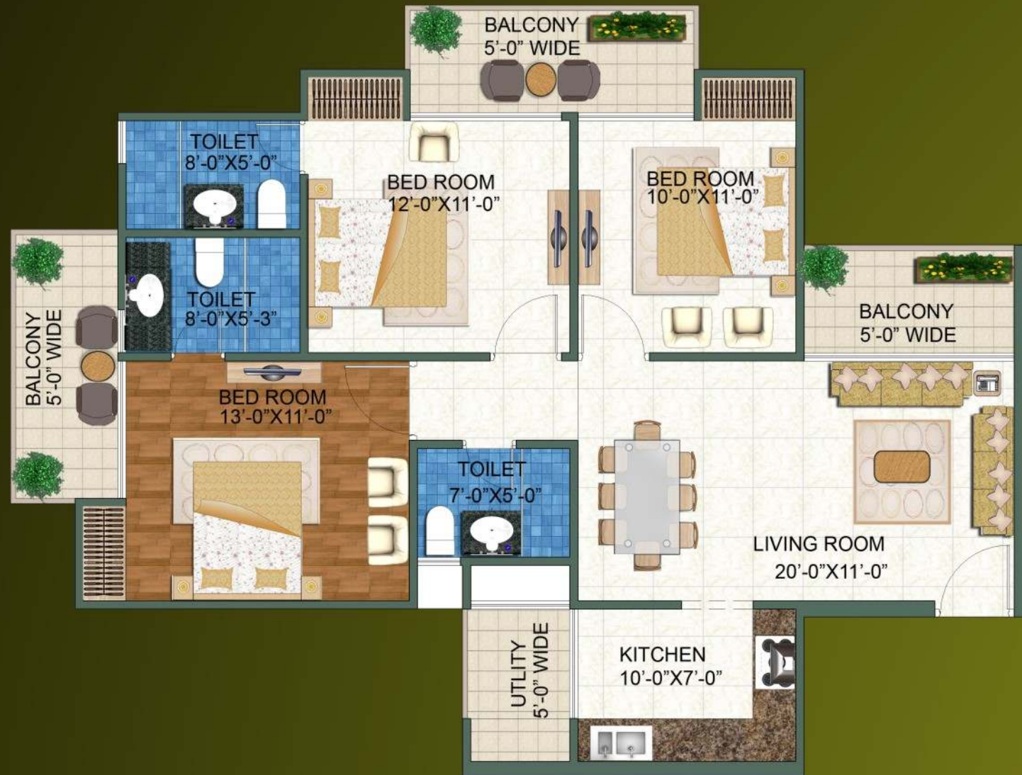
3 BEDROOMS (PLATINUM-2) SUPER AREA = 1500 SQ. FT.