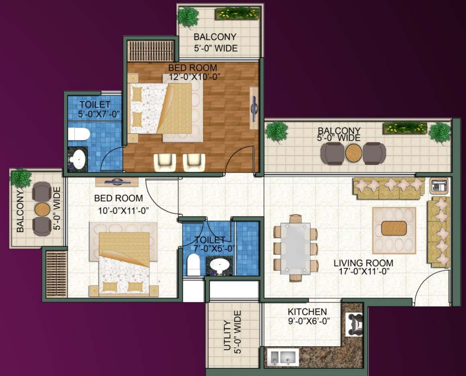
2 BEDROOM (GOLD-2) SUPER AREA = 1115 SQ. FT.