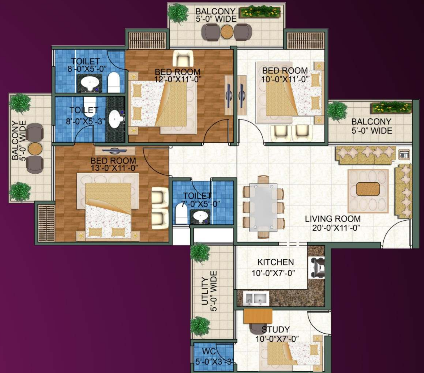
3 BEDROOMS + SERVANT (PLATINUM-3) SUPER AREA = 1656 SQ. FT.