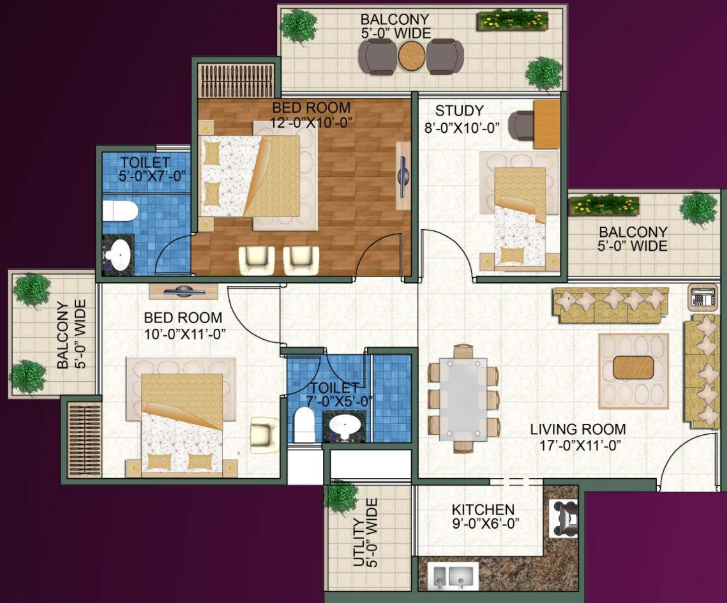
2 BEDROOM (GOLD-3) SUPER AREA = 1225 SQ. FT.