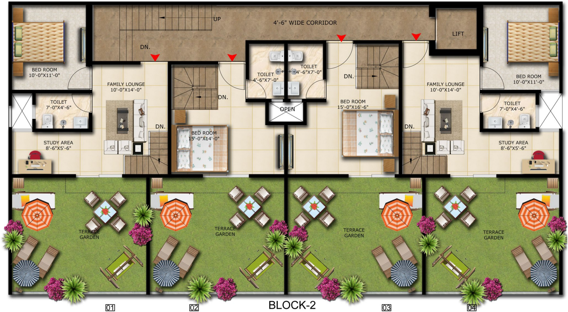
OPULENT DUPLEX FLOOR PLAN TRINITY GRAND