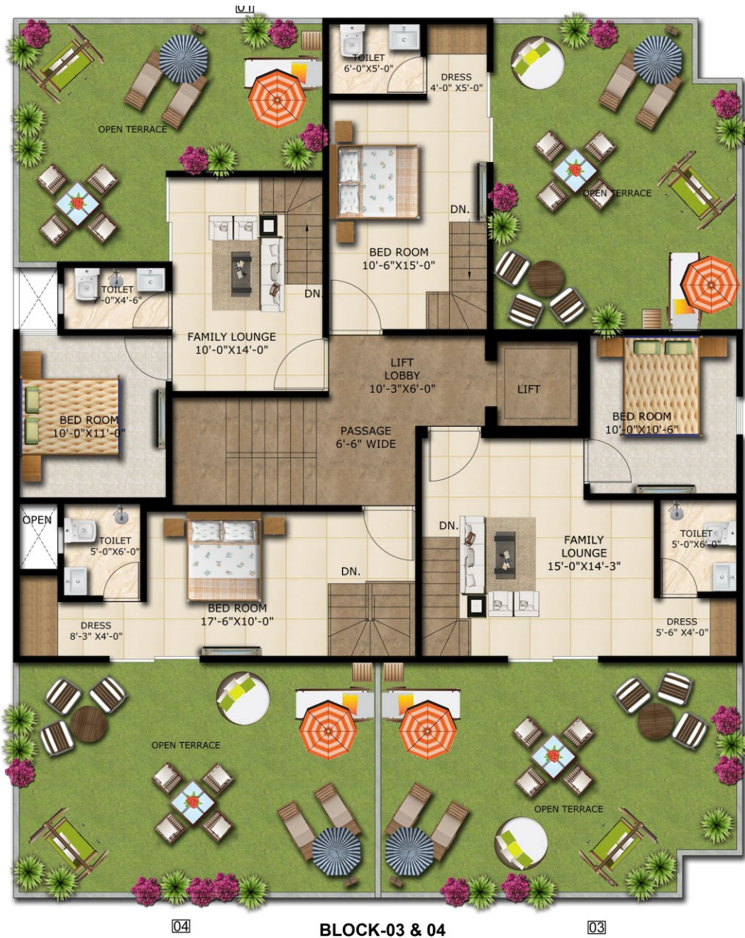
FORTUNE & PREMIA DUPLEX FLOOR PLAN TRINITY GRAND