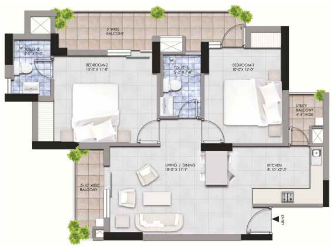
(Super Area 1150 SFT)