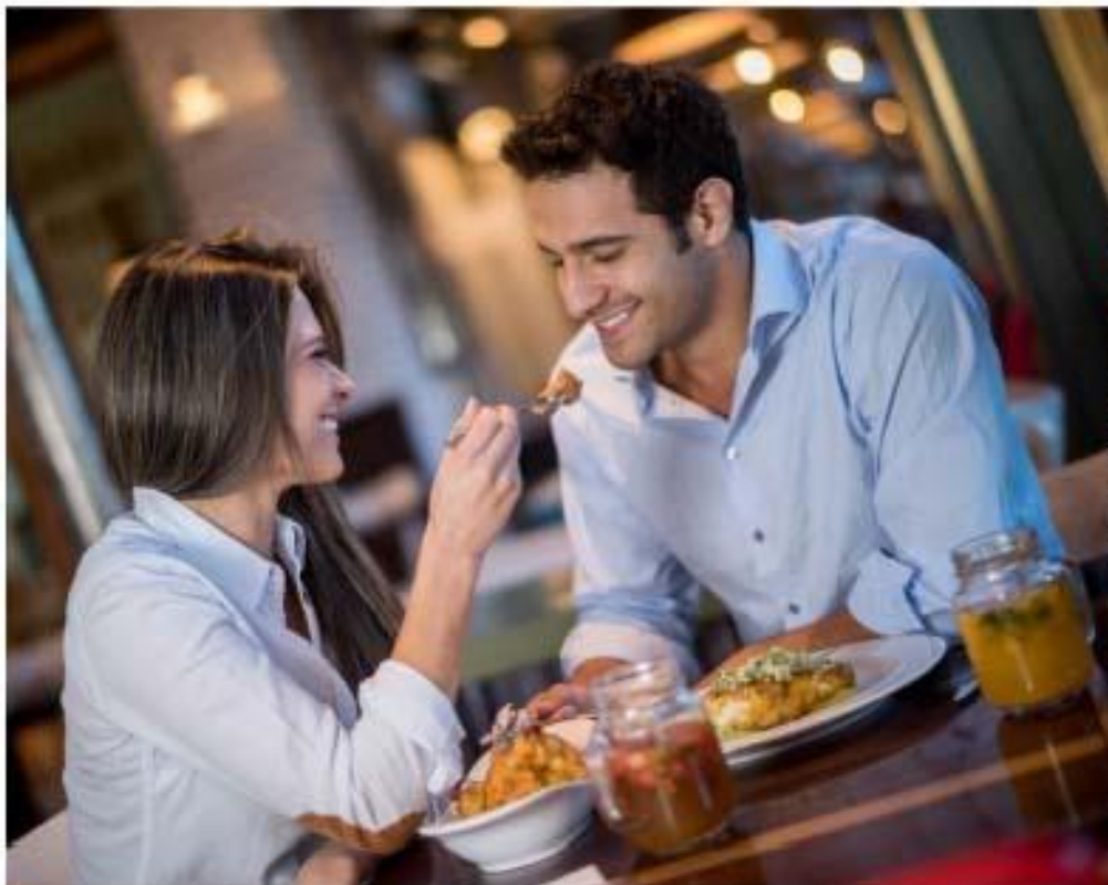
FoodFAIR Restaurants and QSRs