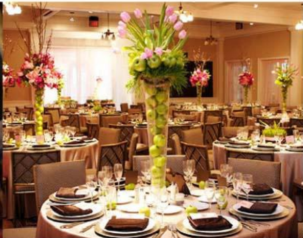
SocioFAIR Banquet Halls